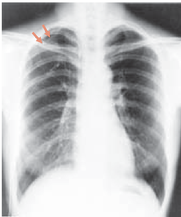
Fig. 1. Preoperative Chest roentgenogram showing a right pneumothorax after continuous chest drainage. The arrows indicate visceral pleura.

Chest X-rays showed a right pneumothorax without bulla or pleural effusion. Although continuous chest drainage was conducted, complete pulmonary expansion was not obtained (Fig. 1). Computed tomography of the chest showed no bulla or