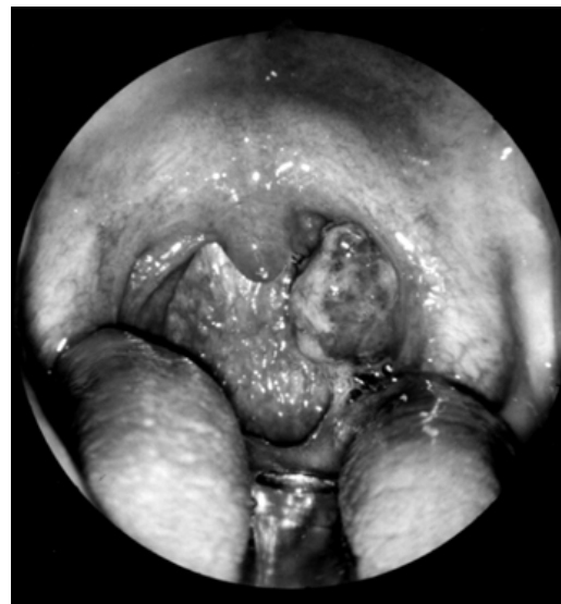
Fig. 1. Oral cavity of the present patient. There is a tumor in the upper portion of the left palatine tonsil.

The patient underwent a left palatine tonsillectomy under general anesthesia for removing the pharyngeal discomfort and for prevent-